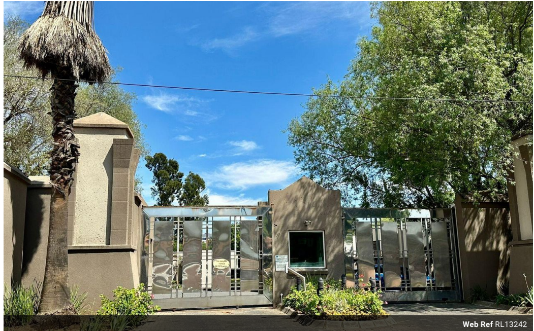
Web Ref RL13242

146 Willem Botha Street Wierda Park 0157