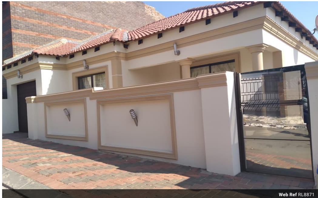
Web Ref RL8871

146 Willem Botha Street Wierda Park 0157