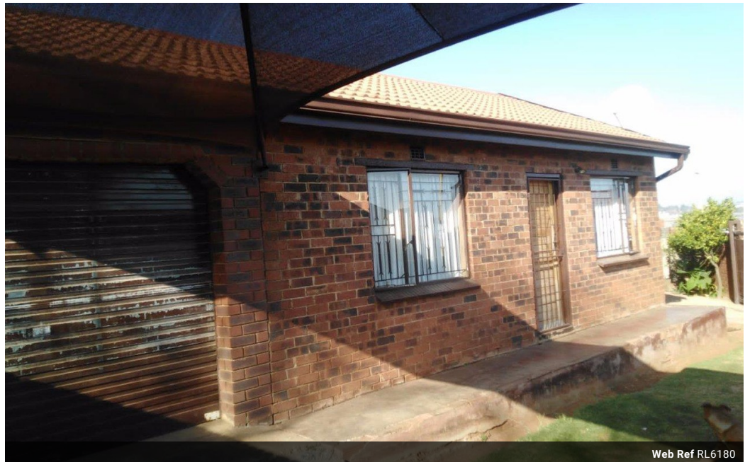
Web Ref RL6180

146 Willem Botha Street Wierda Park 0157