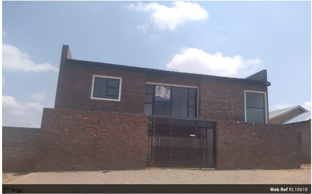
Web Ref RL10618

146 Willem Botha Street Wierda Park 0157