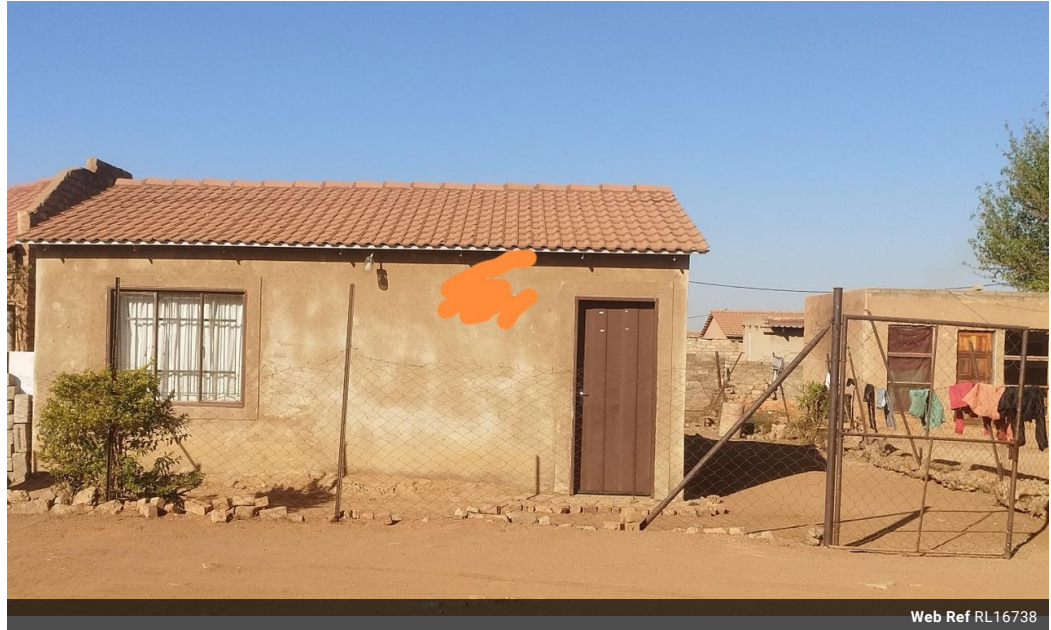
Web Ref RL16738

146 Willem Botha Street Wierda Park 0157