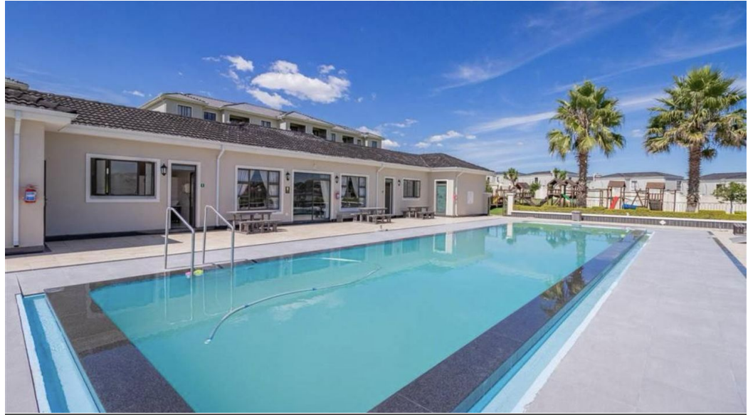
Web Ref RL20302

146 Willem Botha Street Wierda Park 0157