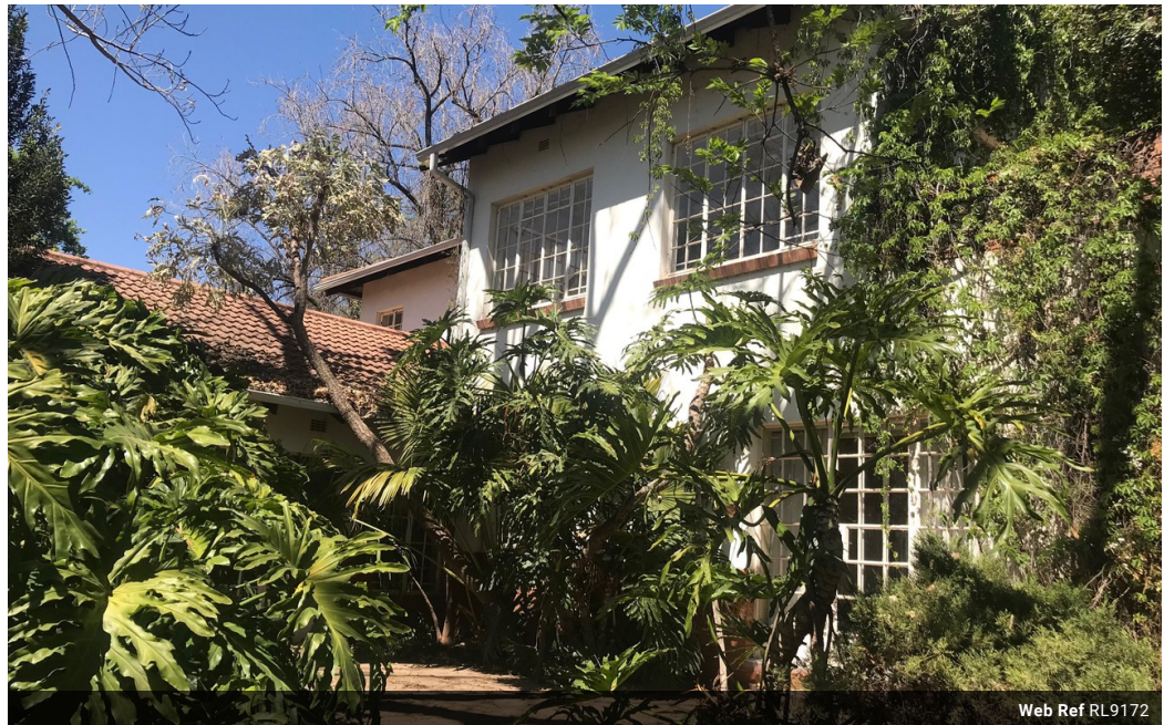
Web Ref RL9172

146 Willem Botha Street Wierda Park 0157