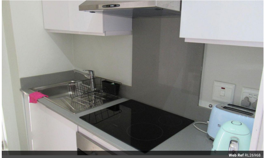
Web Ref RL26968

146 Willem Botha Street Wierda Park 0157