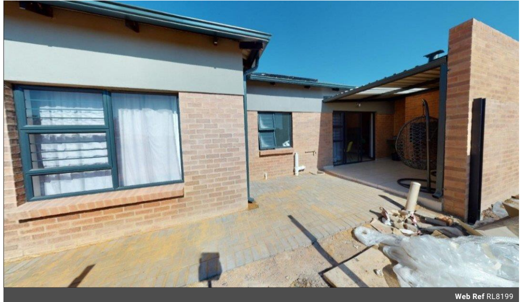
Web Ref RL8199

146 Willem Botha Street Wierda Park 0157