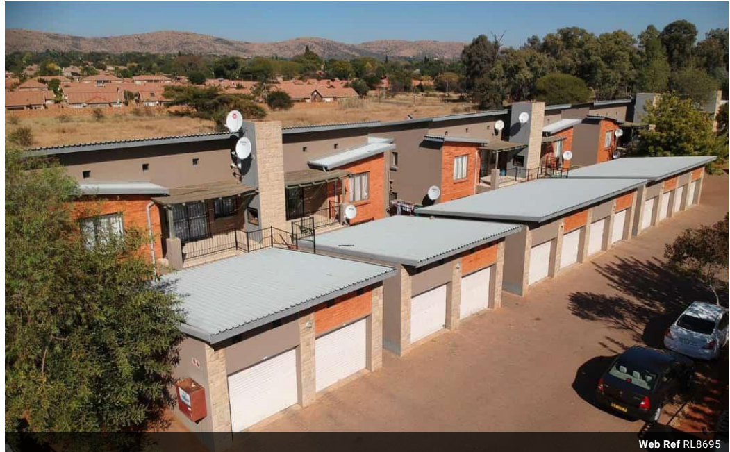
Web Ref RL8695

146 Willem Botha Street Wierda Park 0157