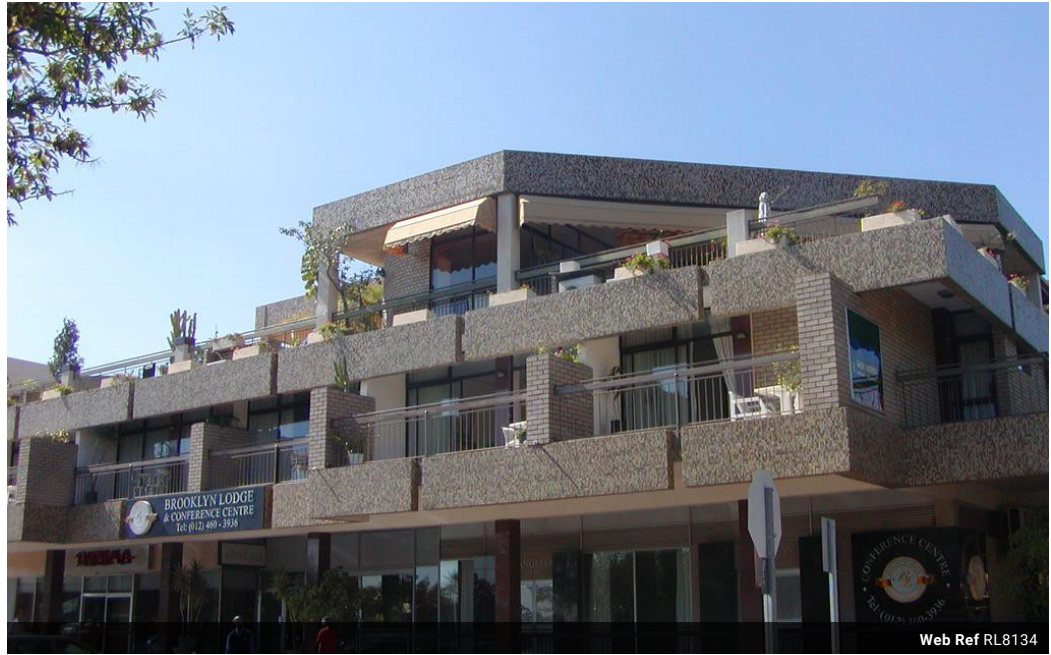
Web Ref RL8134

146 Willem Botha Street Wierda Park 0157