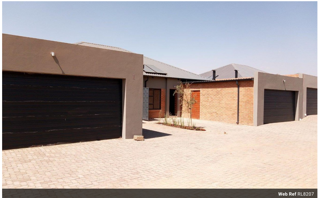
Web Ref RL8207

146 Willem Botha Street Wierda Park 0157