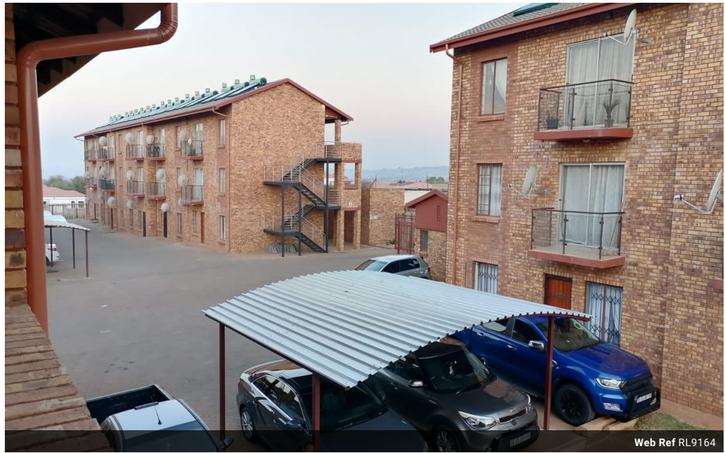
Web Ref RL9164

146 Willem Botha Street Wierda Park 0157