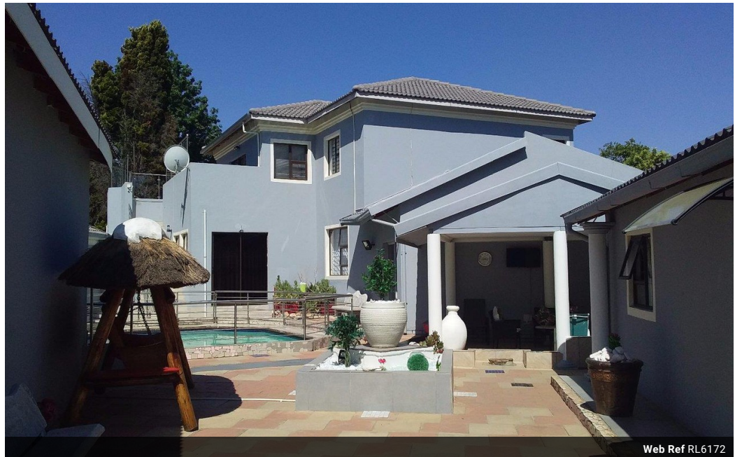
Web Ref RL6172

146 Willem Botha Street Wierda Park 0157