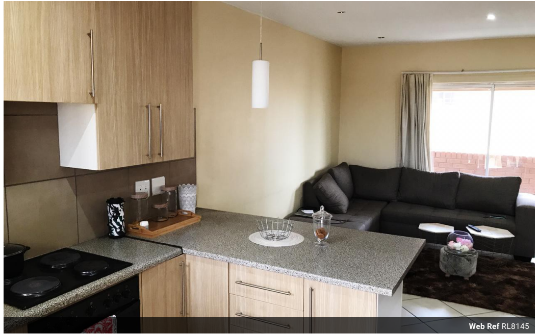
Web Ref RL8145

146 Willem Botha Street Wierda Park 0157