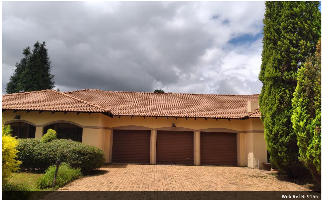
Web Ref RL9156

146 Willem Botha Street Wierda Park 0157