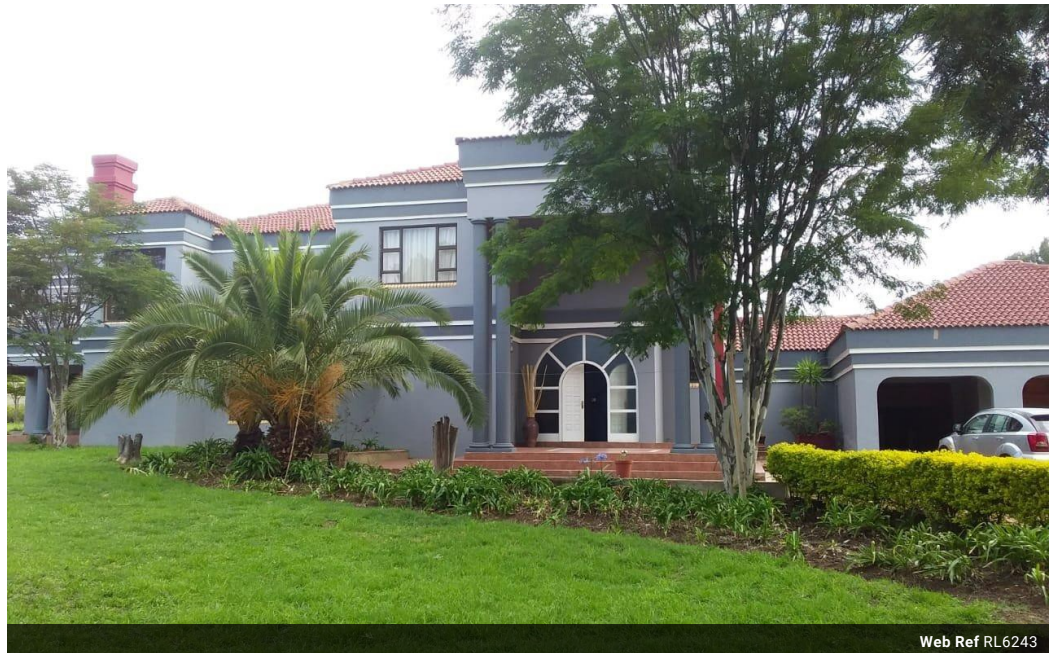
Web Ref RL6243

146 Willem Botha Street Wierda Park 0157