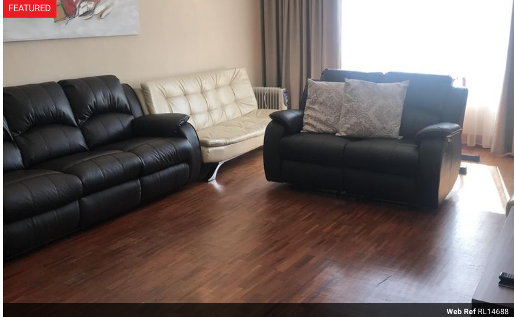
Web Ref RL14688

146 Willem Botha Street Wierda Park 0157