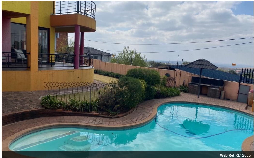
Web Ref RL12065

146 Willem Botha Street Wierda Park 0157