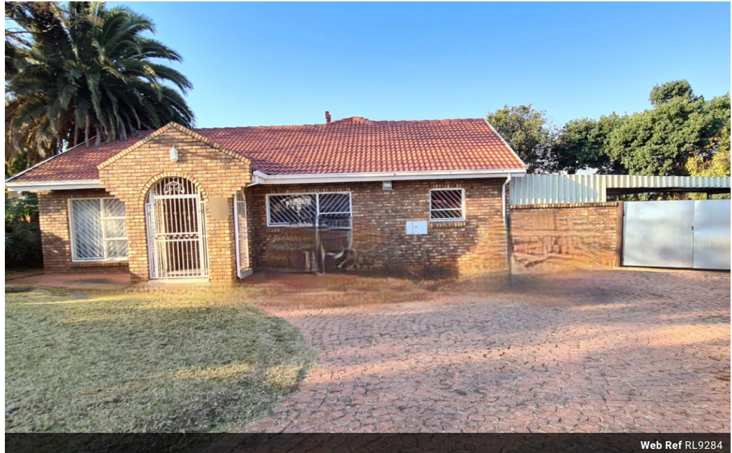
Web Ref RL9284

146 Willem Botha Street Wierda Park 0157