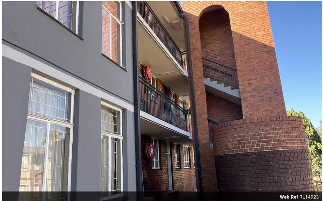
Web Ref RL14923

146 Willem Botha Street Wierda Park 0157