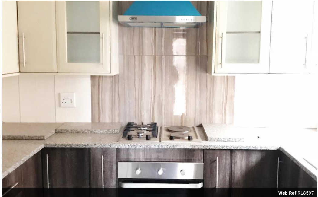
Web Ref RL8597

146 Willem Botha Street Wierda Park 0157