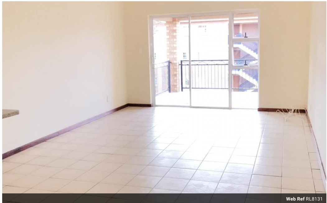
Web Ref RL8131

146 Willem Botha Street Wierda Park 0157