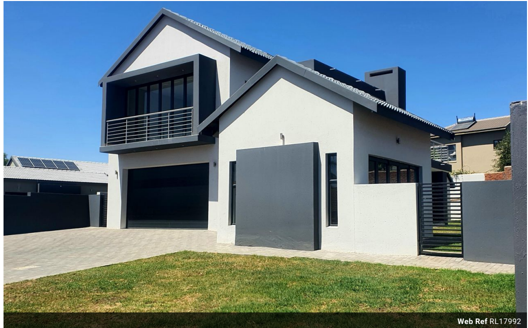
Web Ref RL17992

146 Willem Botha Street Wierda Park 0157