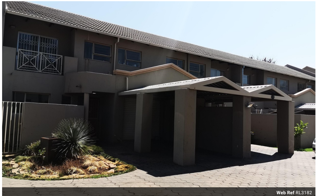
Web Ref RL3182

146 Willem Botha Street Wierda Park 0157