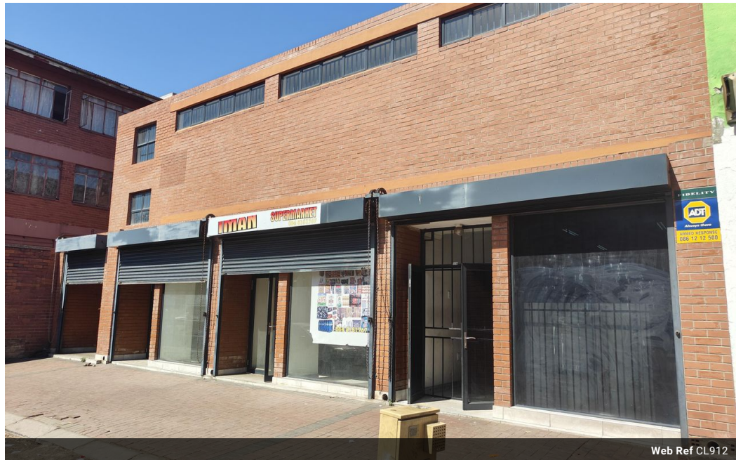
Web Ref CL912

146 Willem Botha Street Wierda Park 0157